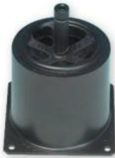
Navy Mounts for Nuclear Submarines